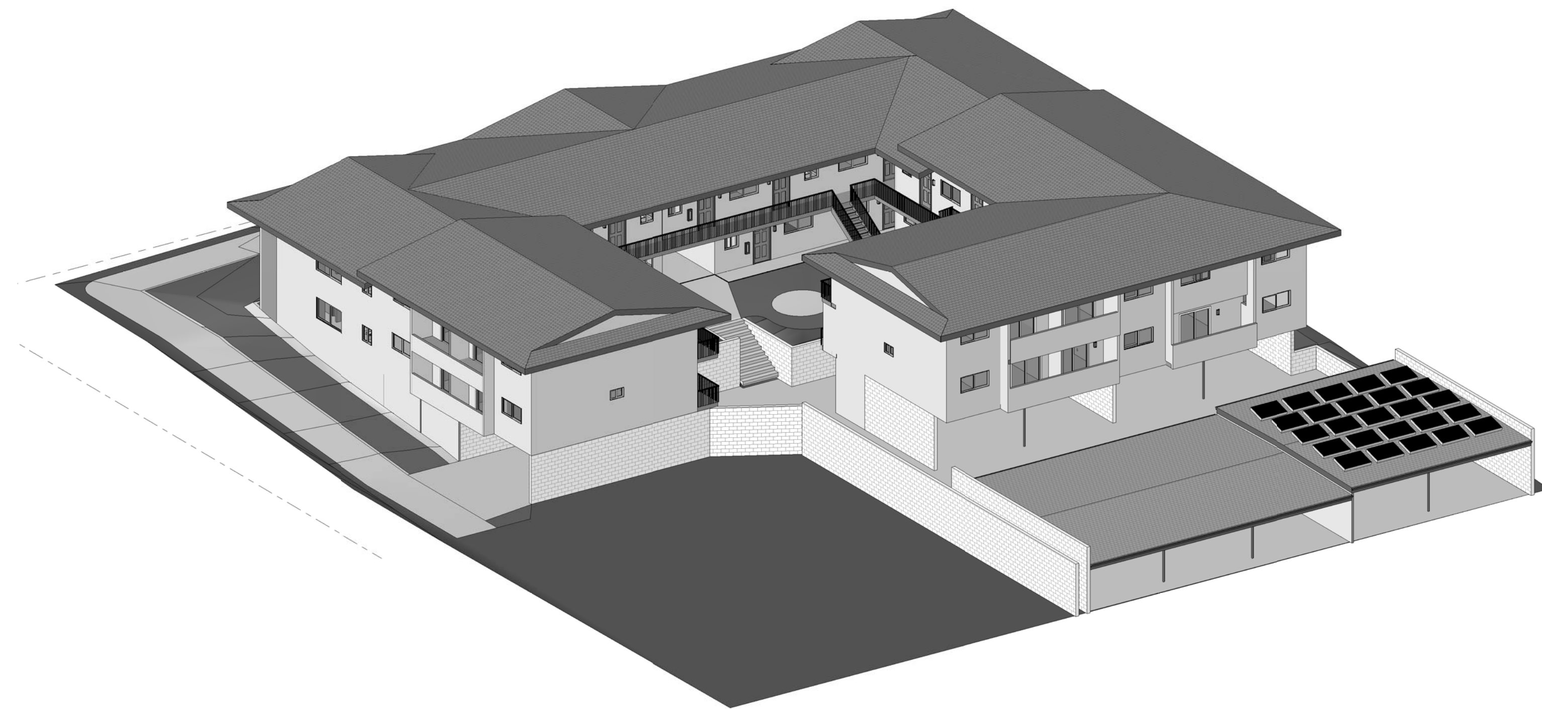
1 SOUTH WEST VIEW